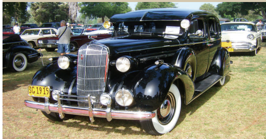
3rd Place - Mizrrahim Morales 1936 Roadmaster