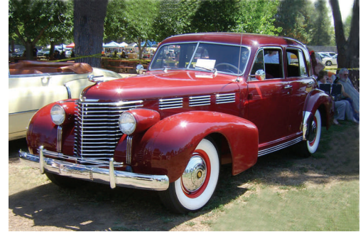
Best of Show Cadillac - below Morgan Woodward 1951 Series 62