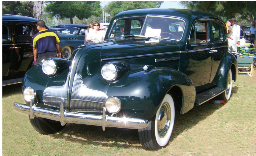
2nd Place 1939 Buick Roadmaster Model 81 / Owner Erik Unthank