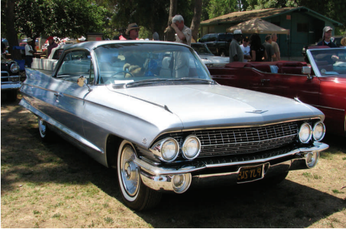
2nd Place F. Burns 1961 DeVille