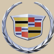
1966 DeVille Convertible